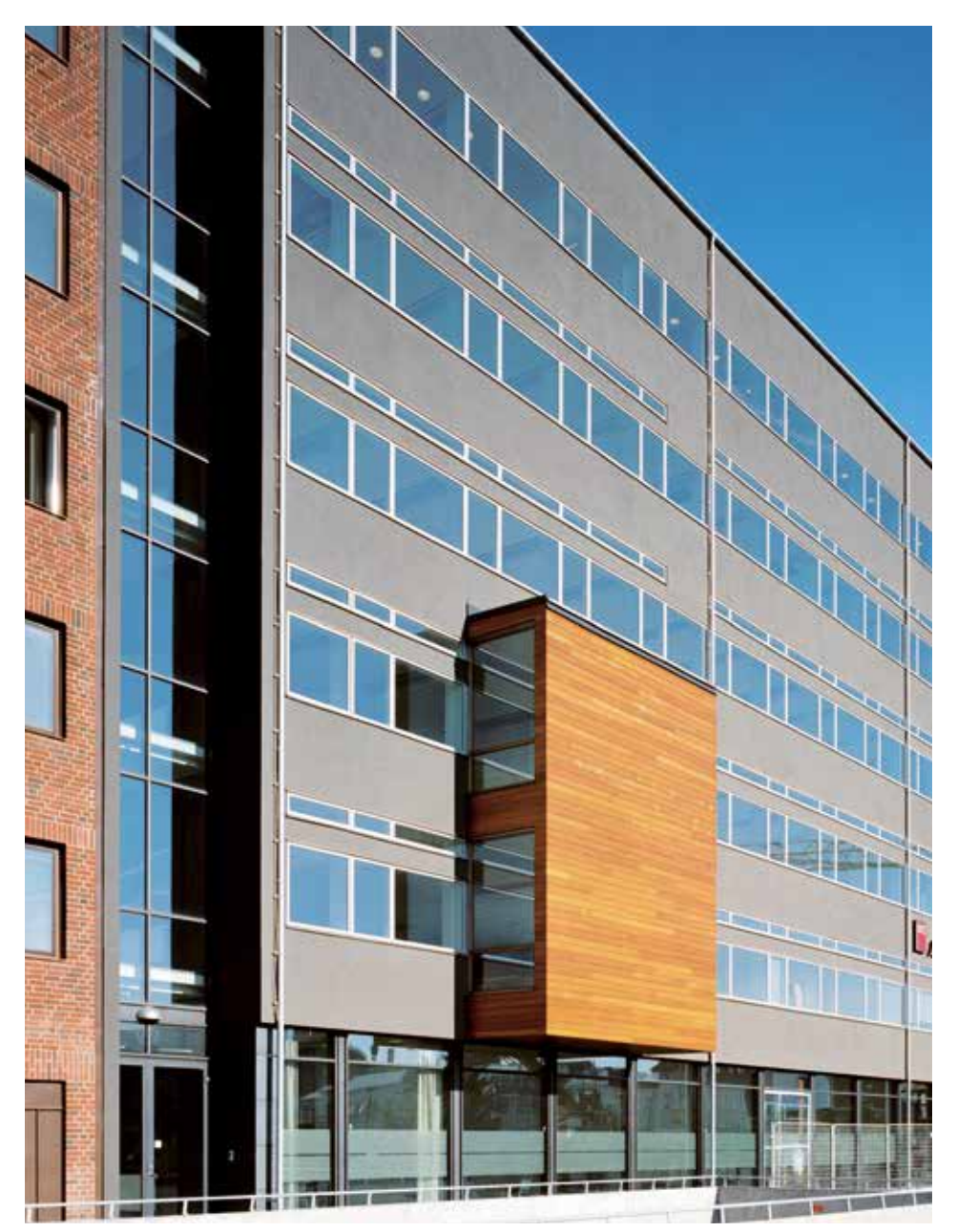
Multiple dwelling Scylla 2, Malmö/Sweden Architectural firm: White arkitekter AB, Malmö/Sweden