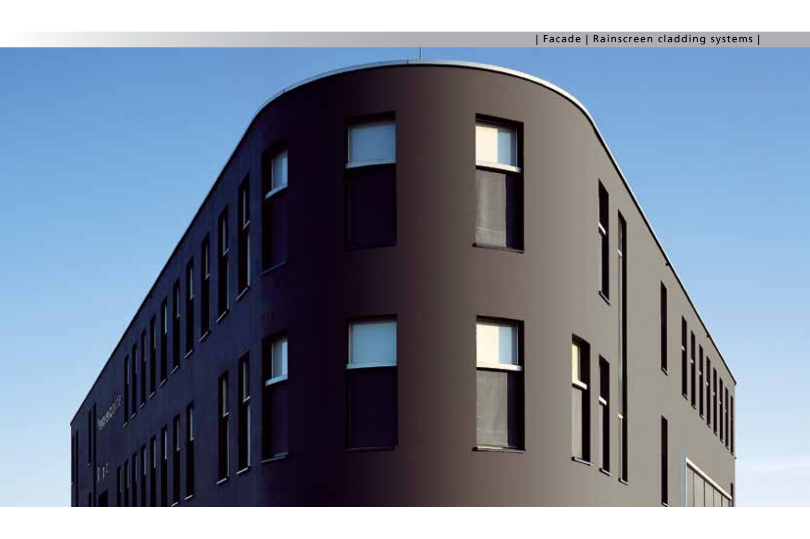
StoVentec Ventilated rainscreen cladding systems