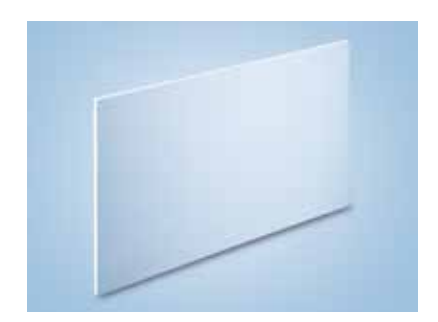
The render carrier board in recycled glass incorporates outstanding material properties which have secured it an outstanding track record worldwide.