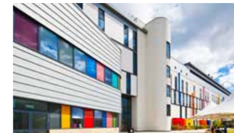
Queen Elizabeth University Hospital, Glasgow