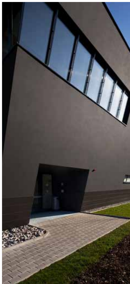
EDEKA Hieber, Germany

Thanks to Sto's X-black Technology, the heat-reflective façade paint is able to keep temperature peaks caused by solar radiation reliably below 70 °C. This is made possible by innovative NIR (near-infrared) black pigments, which simply reflect a large proportion of solar energy. To guarantee high binding strength and colour stability, the matt façade paint is based on 100% pure acrylate. This provides optimum protection for the façade against discolouration, chalking and crack formation.