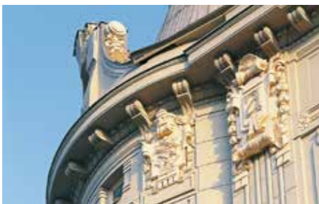
Municipal office, Czech Republic