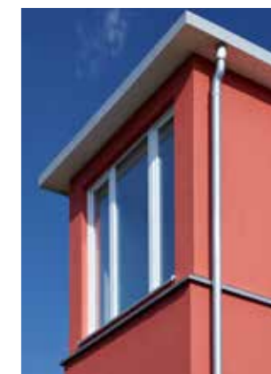
Residential building, Germany