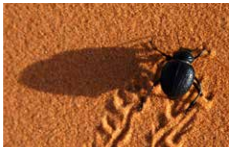
The shell of the fog-basking beetle was the inspiration for the façade paint StoColor Dryonic.