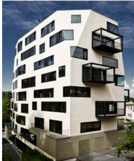
Private Residence, Czech Republic

The inspiration for the StoColor Dryonic façade paint was the fog-basking beetle. Just like the beetle's shell, the paint has micro-textures that both repel and channel water at the same time. This innovative Dryonic Technology allows water on the façade resulting from rain, dew and fog to run off almost instantly. The best ideas often come from nature. And from Sto.